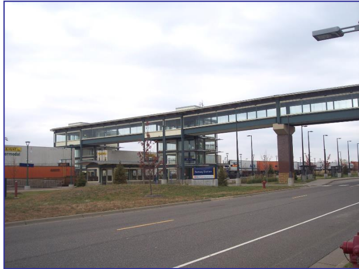
Parking ramp & skyway to Northstar Rail Line